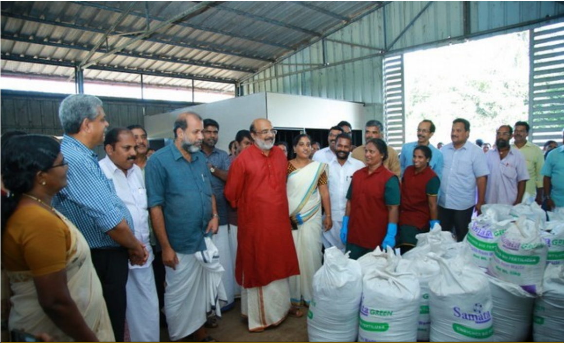
Hon. Finance Minister Dr. Thomas Isaac visits Kurukkanpara SWM Plant