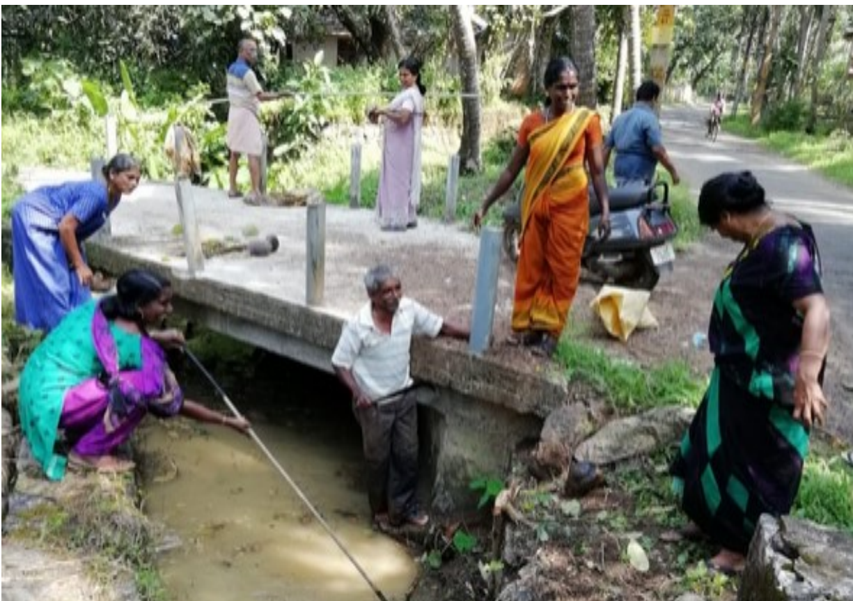
Kurukkanpara ALF members cleaning drain

Kudumbasree members also actively participate in the conservation of ponds, natural drains etc. ULB has cleaned three ponds and a major canal in the last year by the members of Kudumbasree. We recognize, as a women collective, we have a crucial role in keeping the environment in its clean condition so as to ensure a good living condition to the generations next.