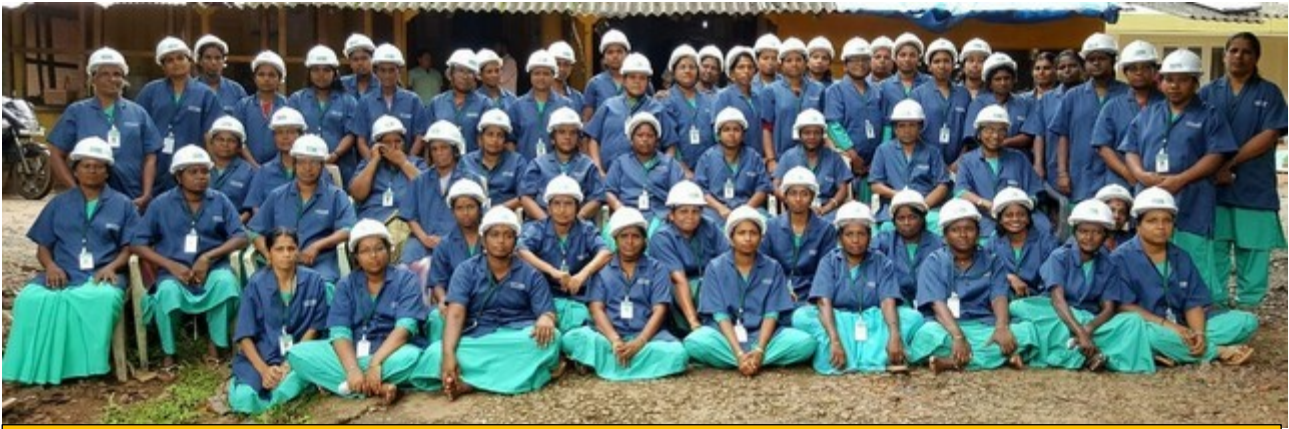
Haritha Karma Sena (Green Army)