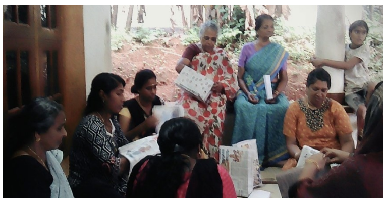
ME group in paper bag making from Kurukkanpara

As per the new plastic rules Kunnankulam Municipality also take initiatives for the reduction, reuse, and recycling of the non-bio degradable wastes. Green protocol campaign is effectively conducted here through the Kudumbasree networks. Women micro