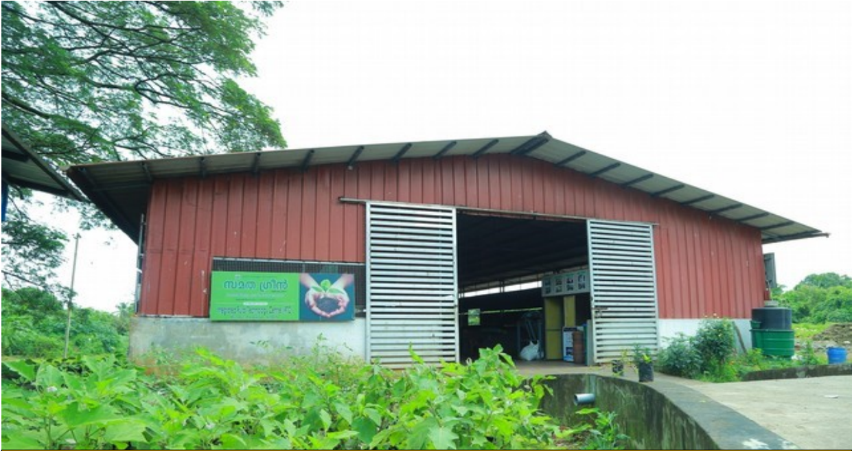
Green Park, Kurukkanpara, Kunnamkulam Municipality (Solid waste management plant) operated and maintained by SHG, Samatha Green