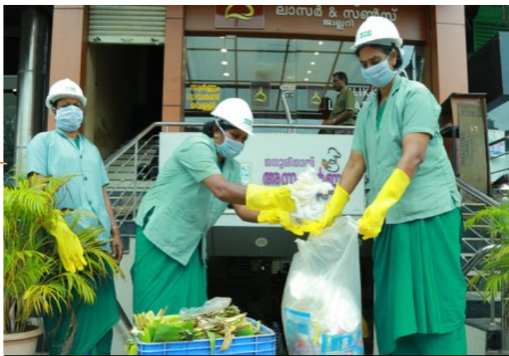
Kudumbasree sanitation group collecting segregated waste from town

Kunnamkulam is an old merchant town with congested bunch of shop buildings and pathways. The waste disposal at source is not possible here in town in many cases as there is no enough space available in the town area. Women sanitation groups collect segregated waste from shops and hotels and deliver to the Kurukkanpara SWM plant. There are two groups under this ULB, namely Sevanasree and Aiswaryasree of total 10 members. Each group has their own vehicles for waste collection purchased through SJSRY component. A rate of Rs. 3/- per kilogram is fixed by the ULB for bio degradable waste collection from the shops.