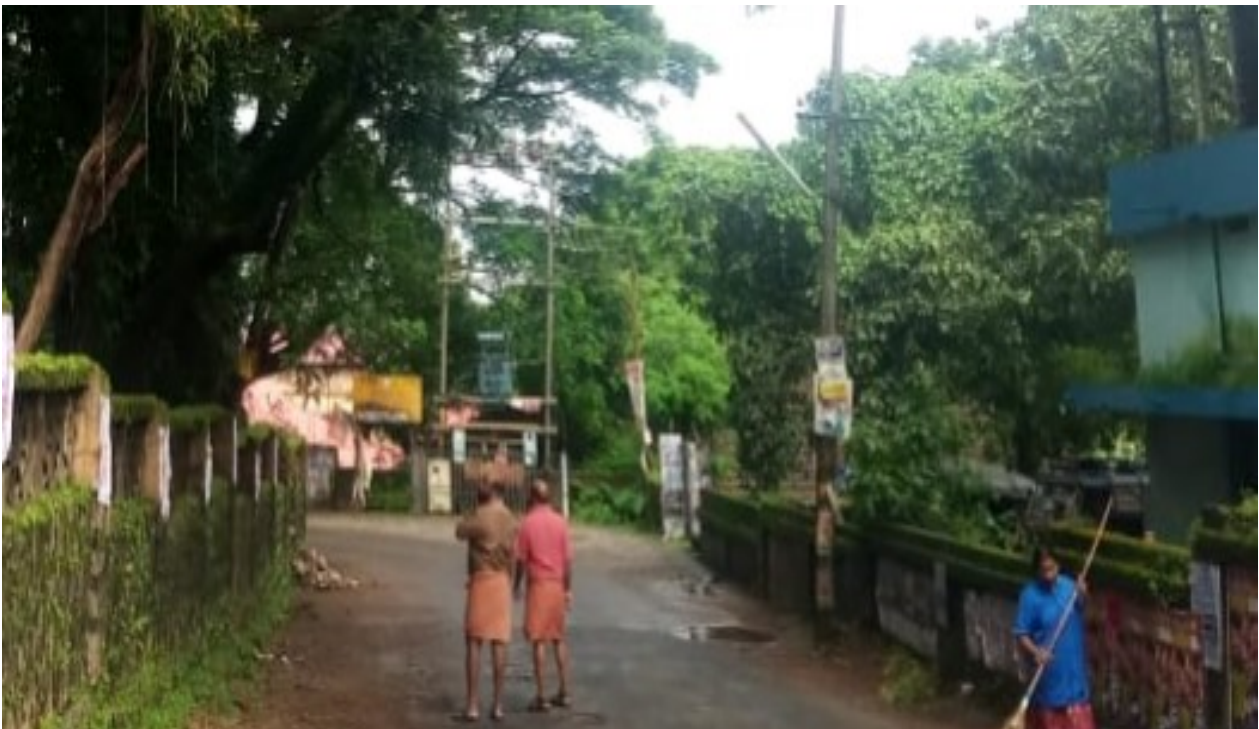
Street sweeping done by the sanitation workers of Kunnamkulam