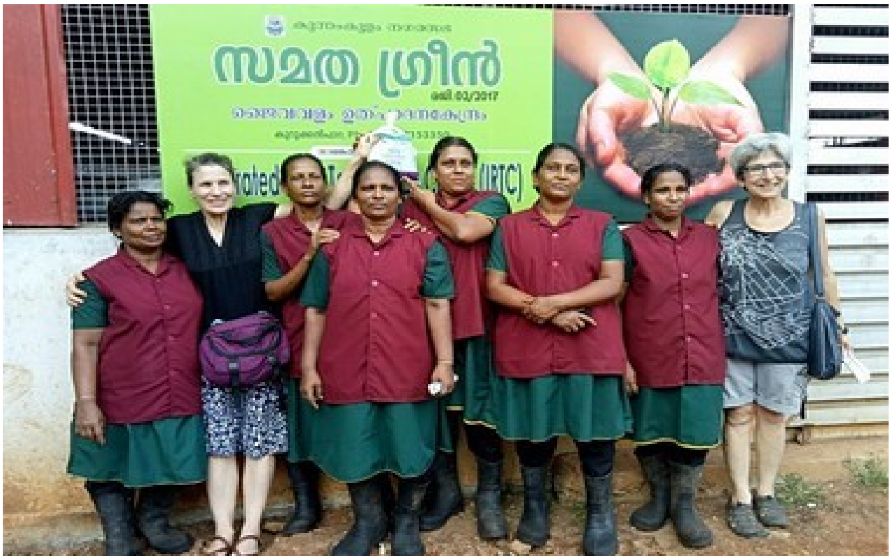
Micro Enterprise Women Group(Kurukkanpara Waste Management Plant)with Experts from USA