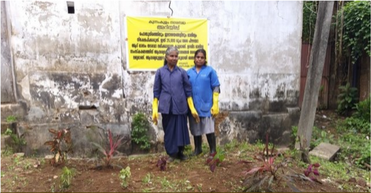
Garbage vulnerable point converted into cultivation land