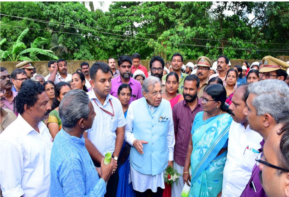
Kurukkanpara plant visited by the Hon. Finance Commission of India